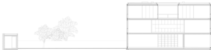
Section – click for larger image